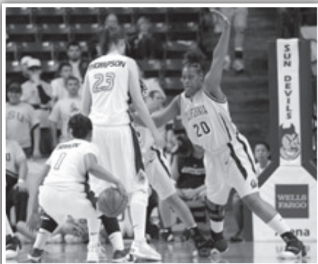
Win over Arizona State