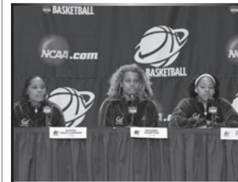
2007-08 NCAA Tournament press conference

In addition to setting the Cal women's basketball and Pac-10 single-game attendance record of 10,525 vs. Stanford Feb. 23, 2008, the Bears established a new home season attendance average record of 2,363 fans per game. The previous mark of 1,656 was set in 2005-06 and 2006-07. Cal won its fourth straight Contra Costa Times Classic in December. Cal ranked in the top five in the Pac-10 in 13 of 19 statistical categories and was No. 1 in four areas. Cal averaged 16.2 turnovers per game, a significant drop from 2004-05 (21.2 tpg) – the year before Joanne Boyle was hired. Cal tied the school record for free throw percentage in a game at 92.9 when the Bears converted 13-of-14 attempts at Baylor Nov. 25. Cal's 99-44 victory over Washington State Dec. 30, 2007, set a new Cal women's basketball Haas Pavilion scoring standard and stands as the largest margin of victory (+55) ever for the Bears in a Pac-10 contest.