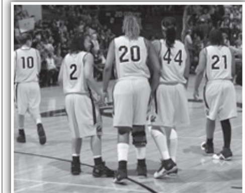
07-08 Cal squad