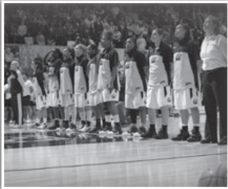
07-08 Cal basketball team