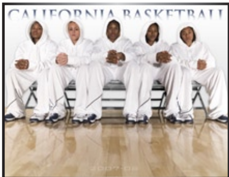
2007-08 guide cover