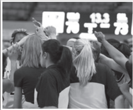
07-08 Cal basketball huddle